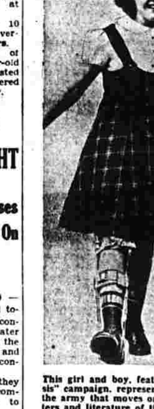
This girl and boy, featured in this year's "Tight Infants Paralyzed" campaign, represent the legions of those who wear braces and crutches. Their pictures appear in all newspapers in honor of the President's birthday. Symbolic of the progress of the campaign, the children are shown in a more active and confident pose than in previous years.